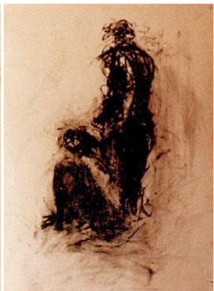
Three student drawings above by Peter Crawford