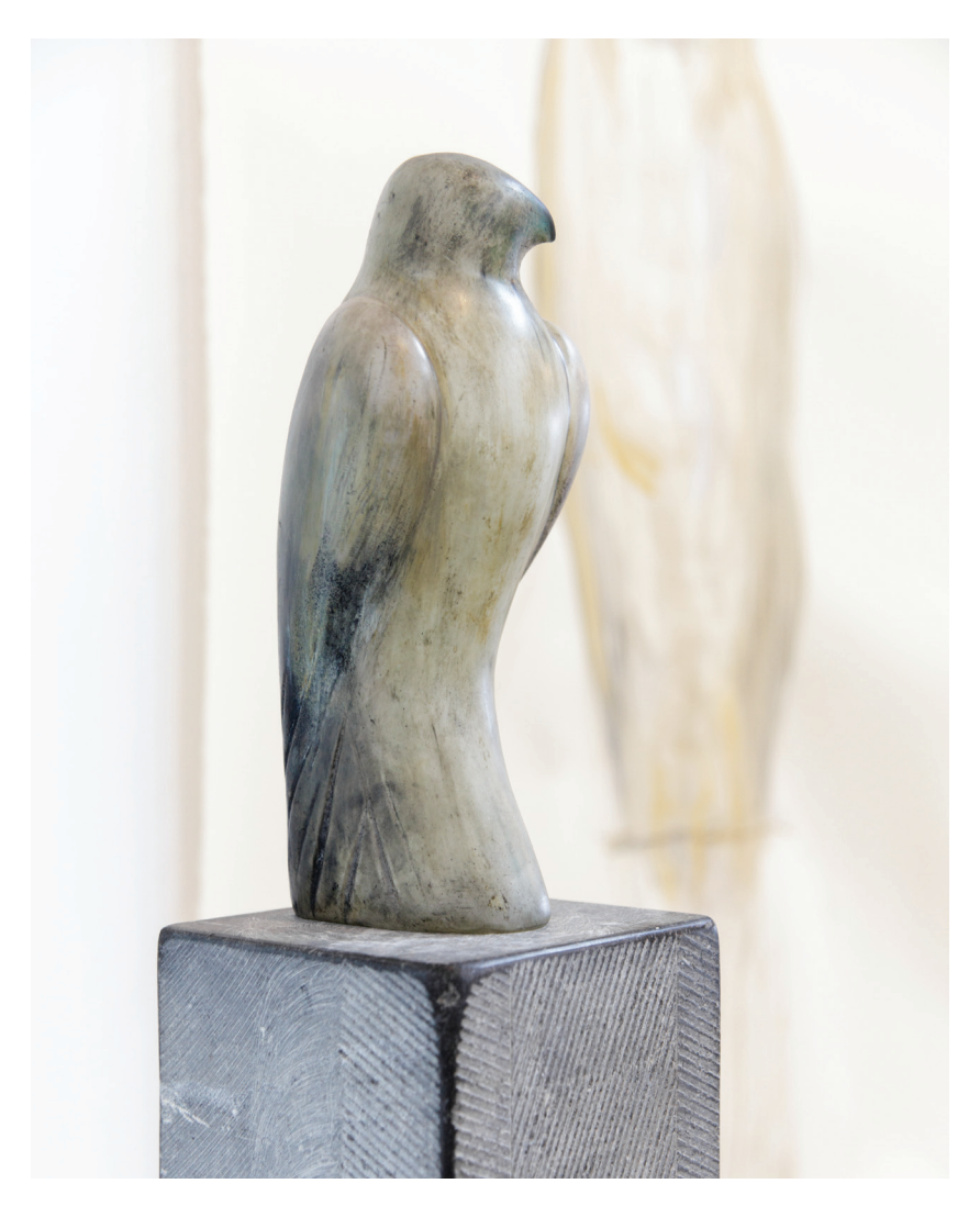
Grey Falcon, 2019