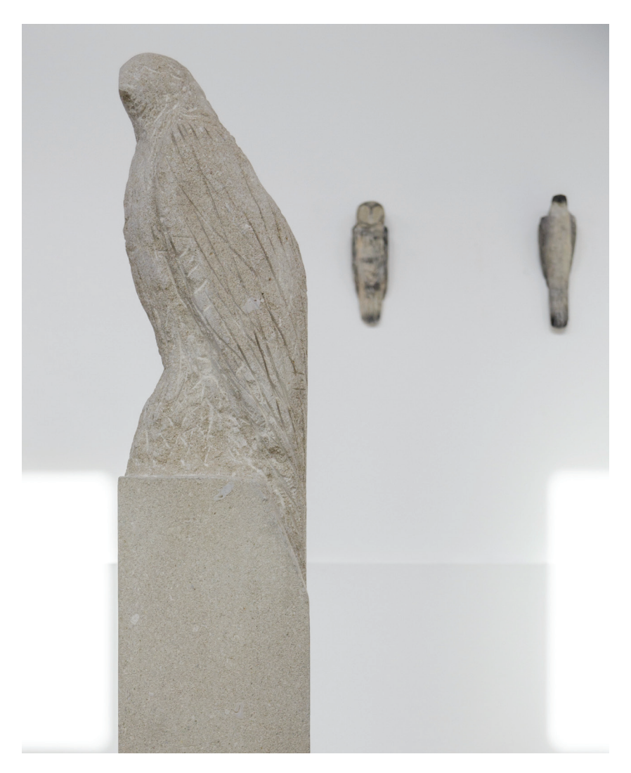
Tall Tale, 2020

opposite: Tall Tale with Morandi Tale and Paterson Wall Birds